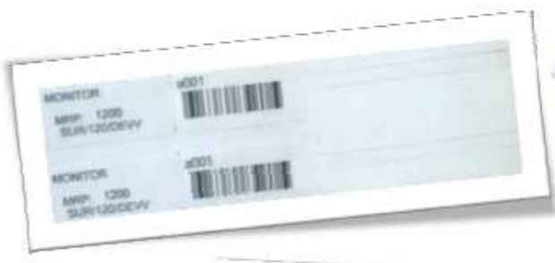
Normal printer that is laser printer based barcode format. no need of barcode label printer.