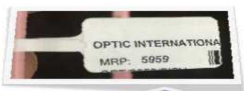
Sample of ready barcode