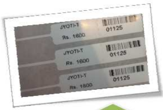
Barcode Printer Based Format.